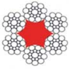
6x19-S + FC